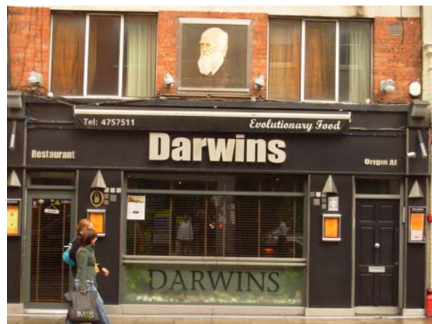
Darwins restaurant in Dublin.