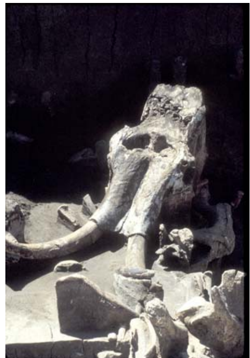
Mammoth bones found at Lamb Spring.