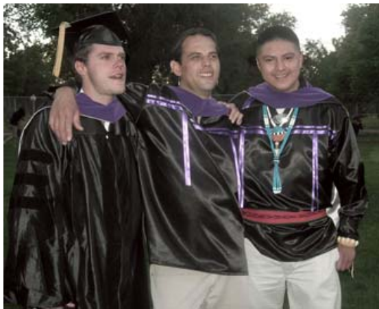
Law students. Vol. 2, Handbook of North American Indians., p. 422.