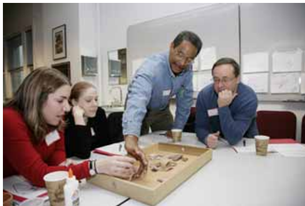
Teachers working on pottery activity.