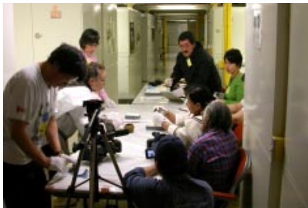
Inuit researchers at MSC

Coordinator of the Kivalliq Inuit Association in Ranklin Inlet.