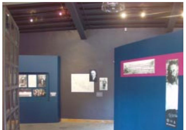
The entrance to the exhibit, with photo of Nelson on the right front.