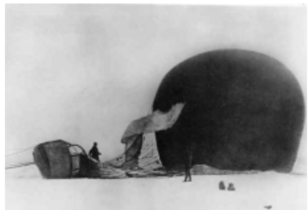
Nils Strindberg’s 1897 photo of the balloon crash.