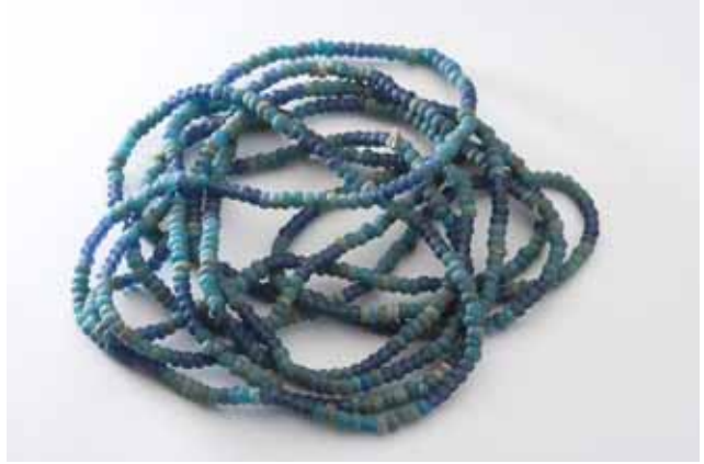
Trade Beads from "Emissaries of Peace: the 1762 Cherokee & British Delegations," provided by the Museum of the Cherokee Indian

Emissaries of Peace: The 1762 Cherokee and British Delegations opens at NMNH on June 27. The exhibit, produced by the Museum of the Cherokee Indian, provides new insights into the complex interactions between Native and European societies on the eve of the American Revolution. This is brought to life by a variety of items from their daily lives—