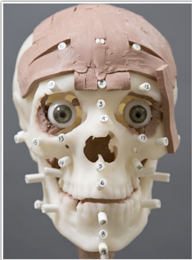
Figure 2. Applying strips of clay, the artist begins to rebuild the face, filling in around the markers with clay.

A trained sculptor, who is familiar with facial anatomy, works with a forensic anthropologist and uses clay to build the facial features. The forensic anthropologist interprets skeletal features such as the subject's age, sex, and ancestry, and anatomical characteristics such as facial asymmetry, evidence of injuries (a broken nose, for example), and loss of teeth before death. The artist's efforts are shown in the following images of the skeleton in the cellar.