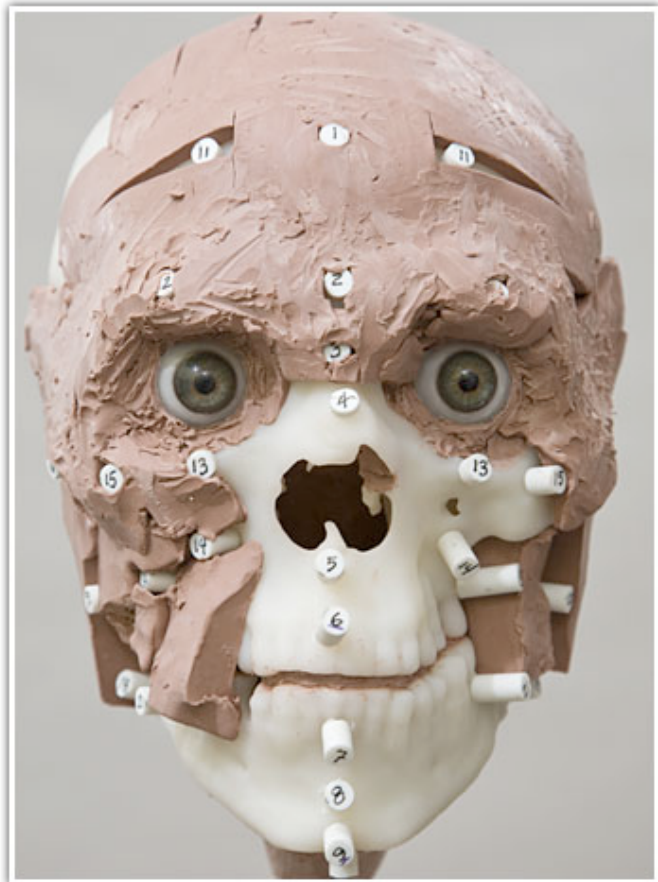
Figure 3. The artist begins to refine features around the artificial eyes.