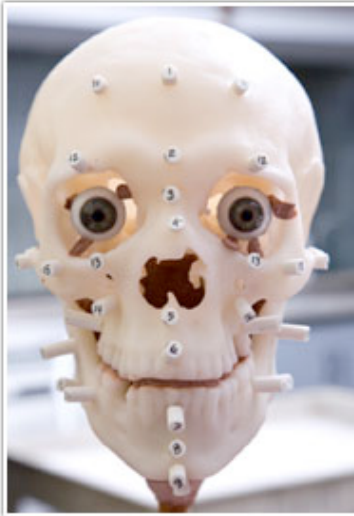
Figure 1. Markers indicate the depths of tissue to be added to the skull (a cast in this case). Measuring these depths is based on studies of males and females of different ancestral groups spanning a century.

The skull provides clues to personal appearance. The brow ridge, the distance between the eye orbits (sockets), the shape of the nasal chamber, the shape and projection of the nasal bones, the chin's form, and the overall profile of the facial bones all influence facial features in life. Using these bones, artists and forensic anthropologists work together to reconstruct facial appearance through the process of forensic facial reconstruction.