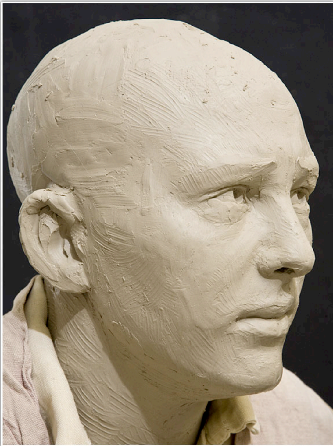
Figure 9. Side view of the boy in the cellar.