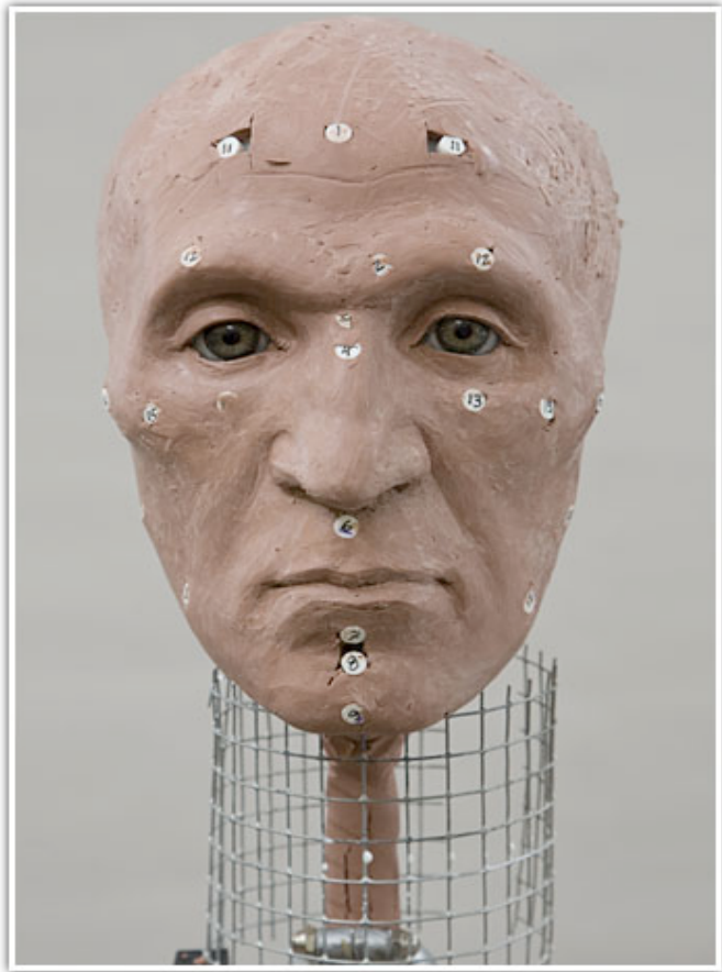
Figure 5. Facial contours have been smoothed and subtle details added to accurately personalize the reconstruction of the skeleton in the cellar.