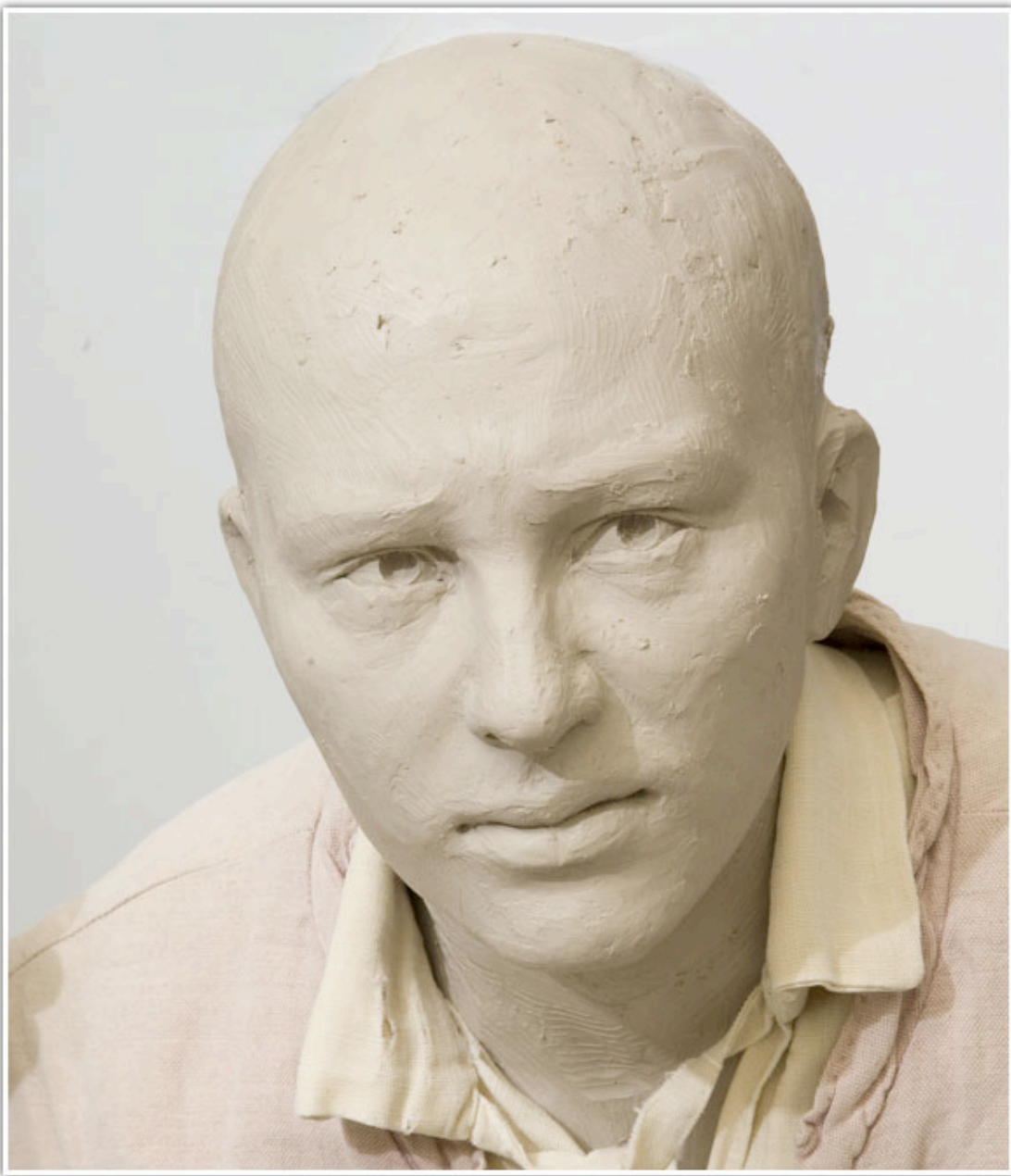
Figure 6: Finished reconstruction of the boy in the cellar.