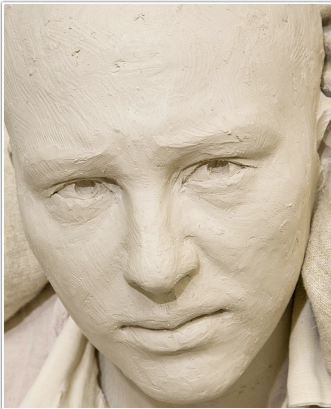
Figure 7: Close-up of boy's face.