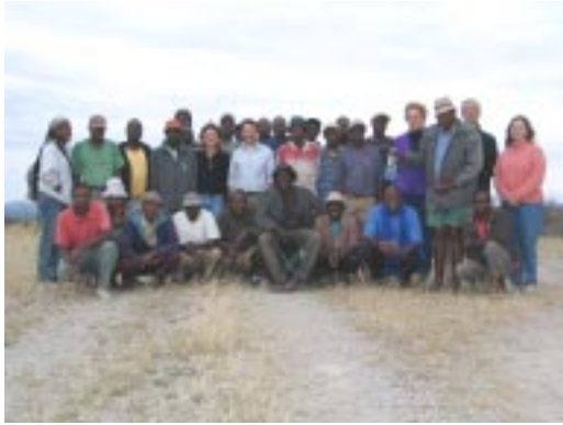
The Ologesailie Field Crew and Research Team, Summer 2005.