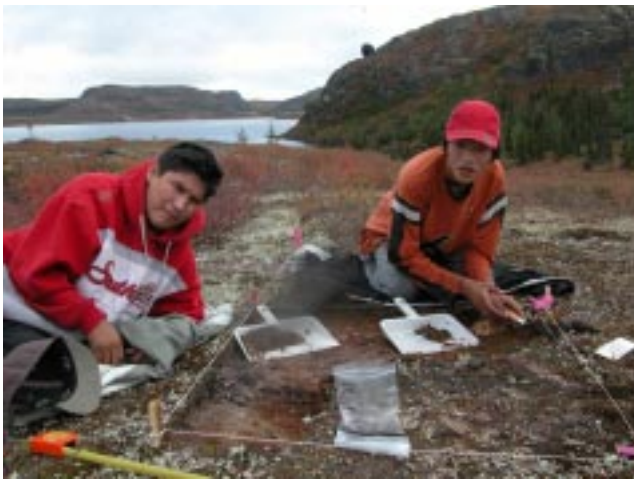
Innu students excavating 4000 year old Maritime Archaic site at Kamestastin (DSCN0039).