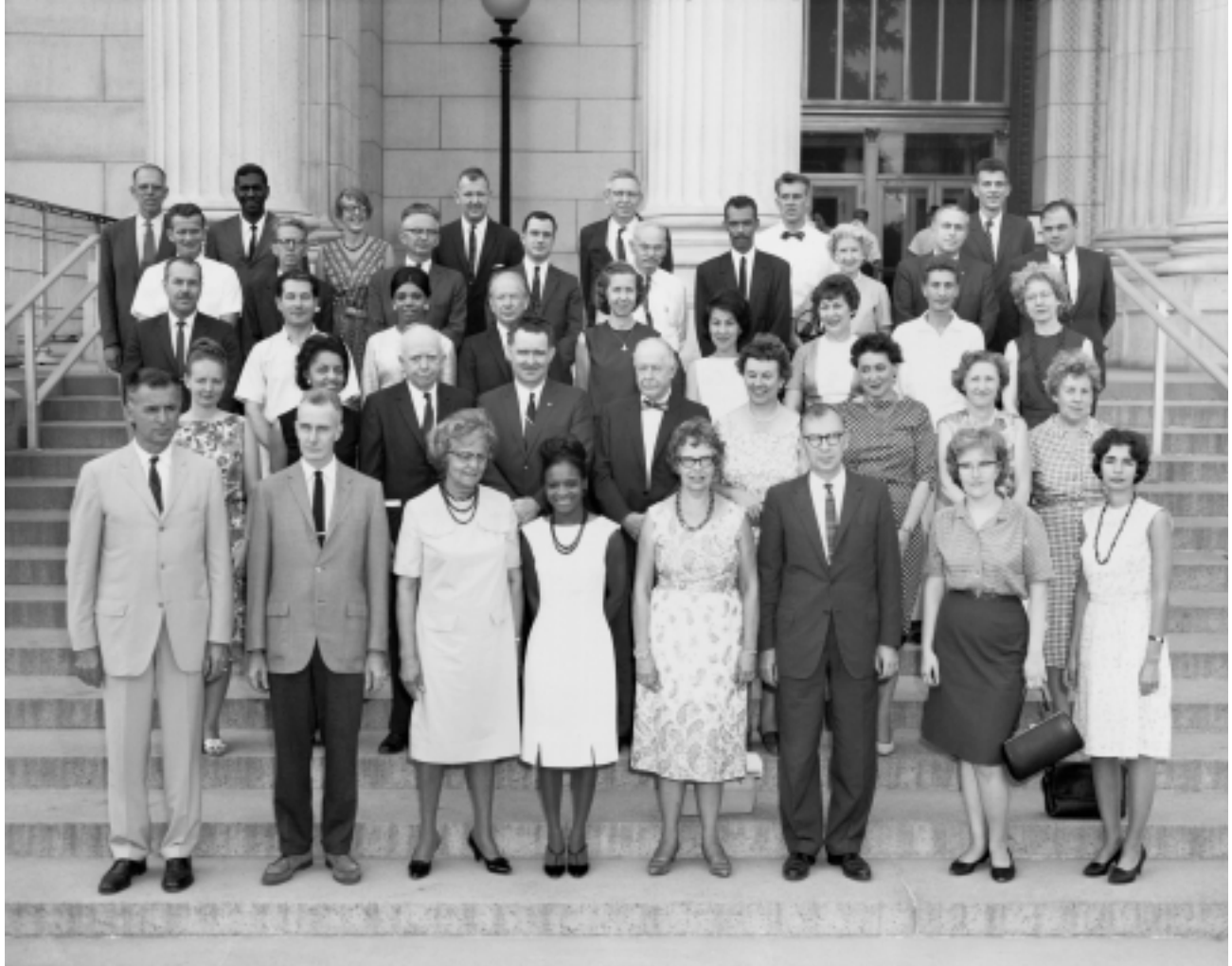
Anthropology Department in 1965