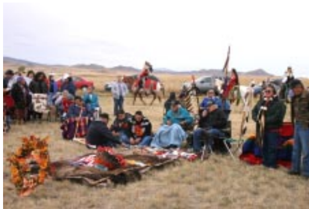
Commemoration of the battle of Bear Paw, October 8, 2005.