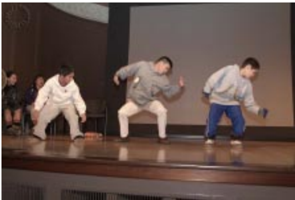
King Island Dancers performance (2005-32717)

An ethnographic film festival took place in the Baird on Saturday, featuring several award winning films, as well as the premiere of When the Season is Good , a documentary about art, culture, and economics in the Bering Sea and Arctic Slope of Alaska. The Alaska: Spirit of the Wild IMAX film played throughout the weekend.