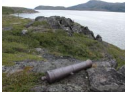
English cannon at the abandoned Moravian Mission station at Okak.