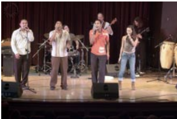
Pamyua performance (2005-32784)