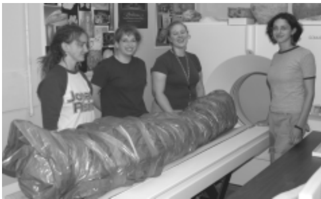
Wrapped mummified body of a teenage boy found in a caste-iron coffin discovered recently in Washington, D.C.