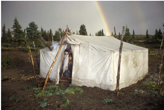
Innu camp in the George River country, 2000.