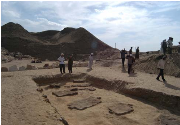
Tops of burial chambers at the queen's pyramids west of the main pyramid of Sesostris III, Dashur.

Collaboration with the Metropolitan Museum of Art In November, Dave Hunt traveled to Egypt to work with colleagues of the Metropolitan Museum of Art to assess the skeletal series coming from the excavations of the mastabas of Dashur. These skeletons are of the same population group as the Lisht skeletal series that the department's Physical Division curates. Hunt and Met colleagues will analyze the Dashur series of approximately 600 skeletons and compare them with the Lisht skeletal series. A publication is planned on the Lisht and Dashur site excavations.