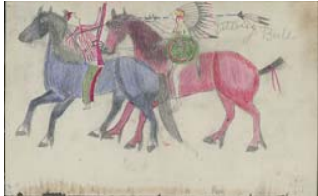
Ledger artwork by Sitting Bull.