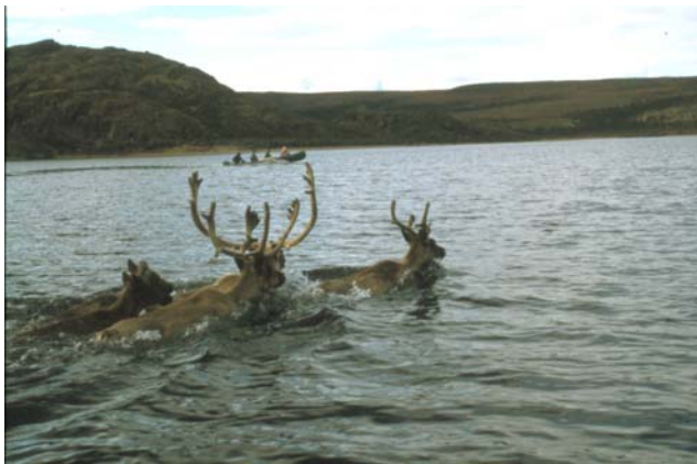
Hunting caribou at Kamestastin, 2006.