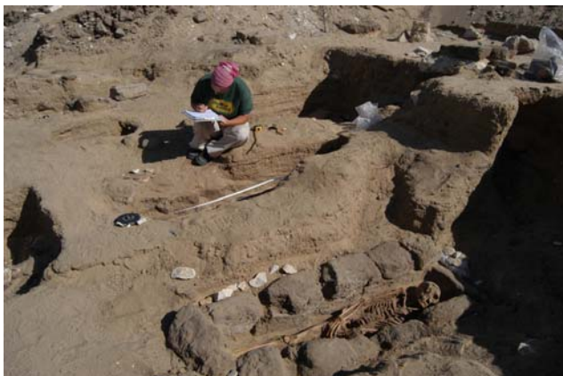
Excavation of late period intrusive burials in the west plaza of the Sesostris III pyramid, Dashur.