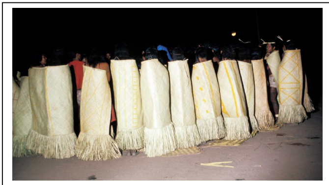
Figure 62 The Formal Friends of the Pepkahàk troop members bear mats on their backs and surround the singing Pepkahàk to keep them warm as they sing all night (1970).

The singing starts so softly that no one outside the plaza can hear it, but little by little it gains momentum and volume, with all participants rocking on their staffs in a circular motion to the accentuated rhythm of the choral chanting. Eventually, it is time to stand up, and then the singing becomes even louder, well punctuated and precise, the men very low and the girls high and harmonizing in several parts. The earlier anthropologist who lived with the Canela, Curt Nimuendajú (1946:216), wrote that this Pepkahàk chanting sounds like a “machine in motion,” and I would say like a slowly accelerating train engine. This is true, and the shrill nasal voices of the girls sound as if the locomotive were gathering speed with its whistle modulating and blowing continuously. This ensemble can be heard a number of miles outside the village and is among the best series of songs the Canela possess. (These days the Pepkahàk songs are always sung on Good Friday evening to prevent God from dying before midnight, so they have become part of a folk Catholic rite that will surely outlast the aboriginal festivals.)