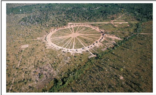
Figure 56. Canela, Brazil, 1970: View of the village from the air.

Canela means “cinnamon” in Portuguese and Spanish, so let’s call these Gê-speaking, South American Indians the “Cinnamon” people. They live in two villages in the high (1,000 feet, 300 meters), “closed” savannas ( cerrados )* of Central Brazil in the state of Maranhão and municipality of Barra do Corda [2002: Pop. 1,300 in the município of Fernando Falcão] and they practice agriculture, although some of their food is still obtained by hunting and gathering (fig. 56). The Ramkókamekra-Canela (pop. 600) and the Apanyêkra-Canela (pop. 250) used to fight each other until they were “pacified” by pioneer fronts of settlers in the first quarter of the last century, but they share the same language and culture with some variations.**