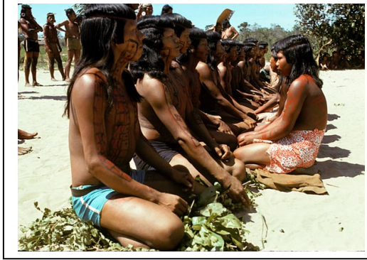
Figure 60 Pepyê novices, just out of internment, line up kneeling in the plaza, facing the women with whom they broke the internment restrictions regarding sexual intercourse (Apanyekra).

While the Khêêtúwayê pageant serves somewhat as a school away from home for inculcating group solidarity, the Pepyê festival, which takes place when the same boys who took part in this Khêêtúwayê festival are a few years older, serves to instill individual self-control, personal fortitude, and certain unique skills into its interneers.