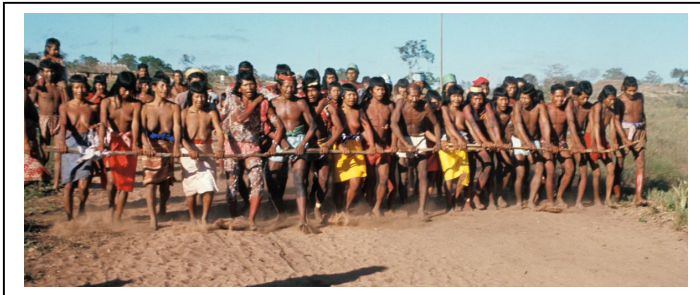
Figure 61 The Falcon troop coming to attack the Pepkahàk (1970).

Again in the Pepkahàk festival, as in the two earlier ones, the internees are “caught” by a representative of the elders, but this time they are selected from all the graduated age classes regardless of their tribal activities and are secluded in a hut which they themselves build about 150 yards outside the village. They are supposed to remain together as a unit, performing services for the community on orders from the elders. No