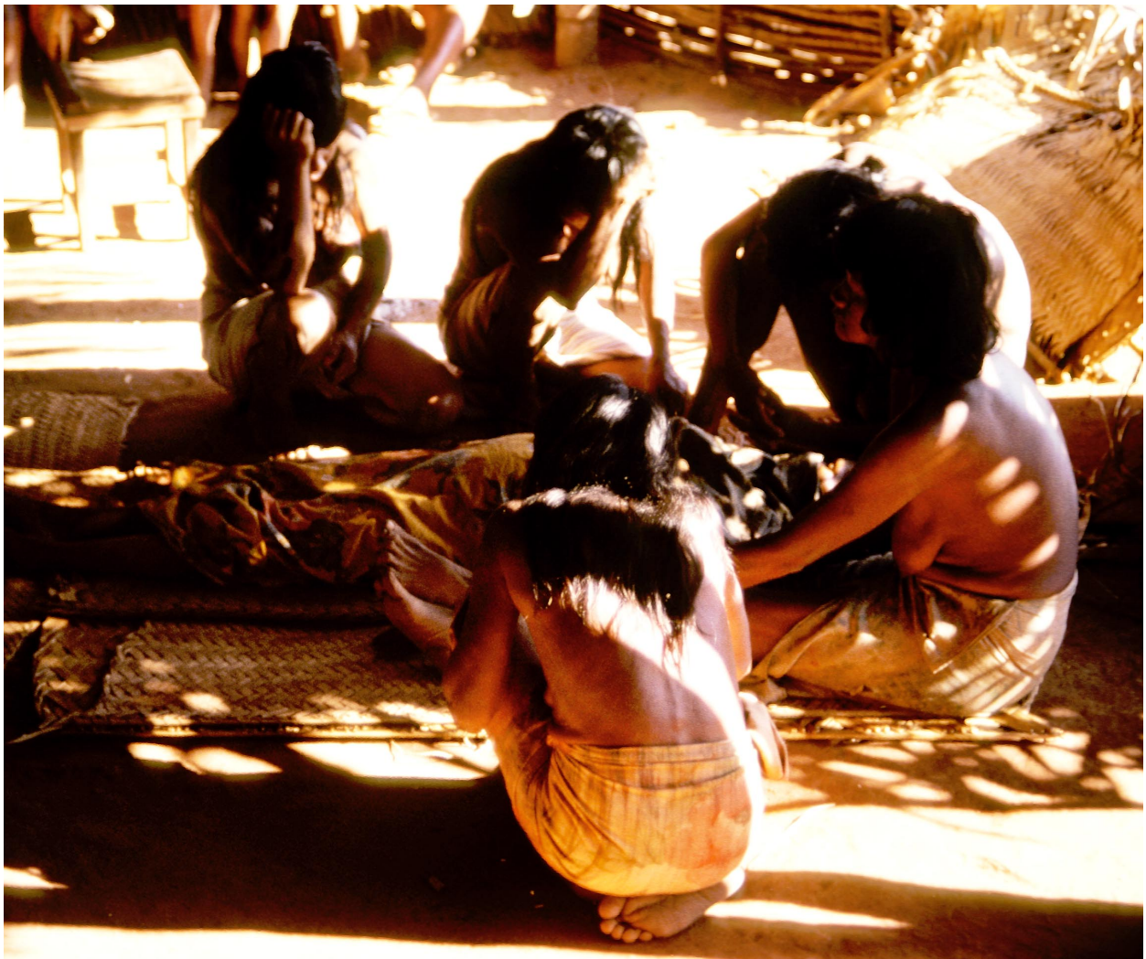
Figure 1. Canela women mourning with formal friend watching.

The most conspicuous aspect of mourning is the wailing done mostly by women over thirty who are close kin of the deceased. Only a few men can do Canela wailing, which involves singing in a high-toned yodeling manner, including words of personal meaning to the mourner.