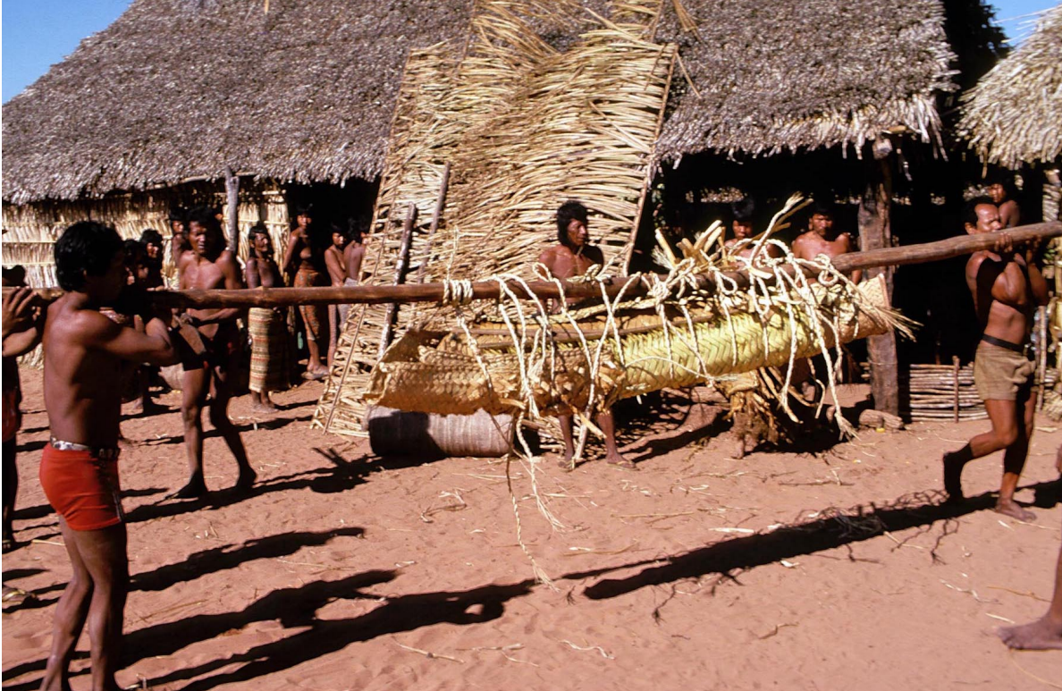
Figure 3. Removing a body from a Canela house to the burial site.

worldly emphasis, and that their having been incipient horticulturalists might be related, I think that the particular structure of their chieftainship is not related at all. I am just raising some Canela characteristics that contrast with some largely pan-Amazonian characteristics to identify the kinds of differences that might be brought up, if and when we debate the merits of this-worldly to otherworldly shifts in belief placement as a measure of an Amazonian people's culture change in the direction of the national culture. Of course, some Amazonian cultures change in parallel with rather than in the direction of their national culture, and my questions would apply less to such parallel culture change.